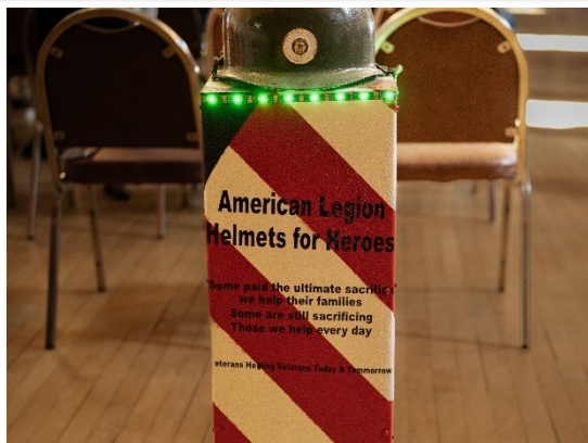
Department Helmets for Heroes