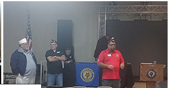
18th District attends Area 5 Caucus