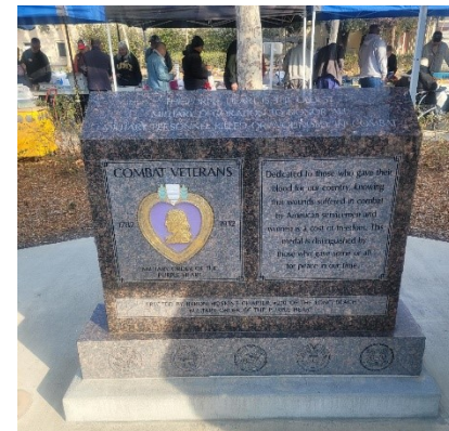
American Legion 18 th District @ Long Beach V.A. Hospital pop-up services. the Legion information booth 01/31/2025