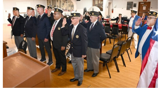
District 18 Installation of Officers at Post 280 6-21-2024