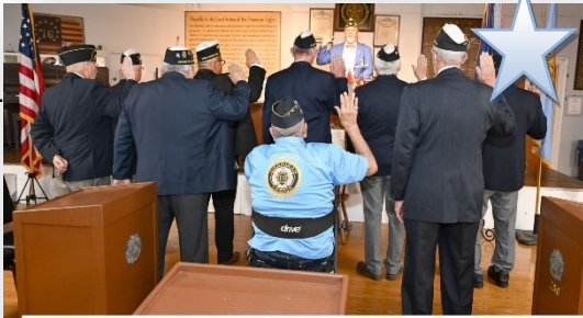
District 18 Oath of Office at Post 280 6-21-2024