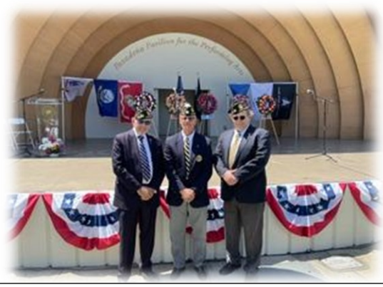
The Pasadena Memorial Day Remembrance with District 18 participating.