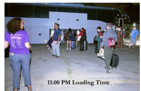
District 18 Boys State program @ Post 261