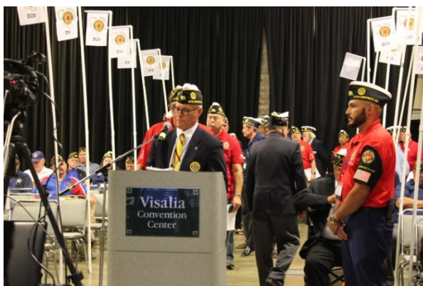
District 18 Voting for our District.