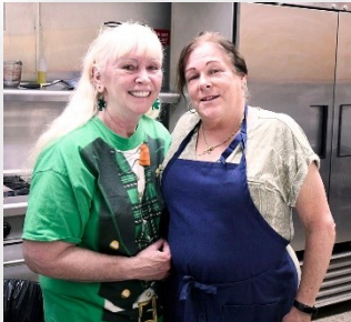
Post 755 cook and meal servers