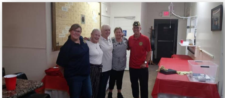
Elegant 18 th District Commander General District meeting @ Post 755