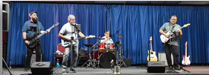
Spaghetti dinner night with band playing 60's, 70's, 80's music 10-14-2023