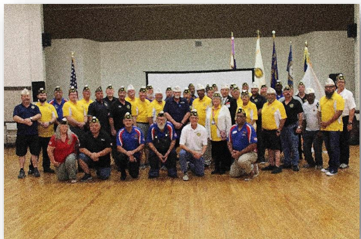
Elegant 18 th District Commander & 1 st Vice Commander @ Dept. Officers Work-shop, Merced, CA. Sept. 16 & 17