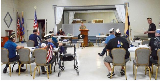
District 18 General meeting at Post 241 9-15-2023

18 th District meeting @ Post 241 Baldwin Park 15 Sept. 2023