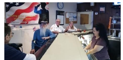
Post 755 Charter Cove Memorial Day program Elegant 18 th District