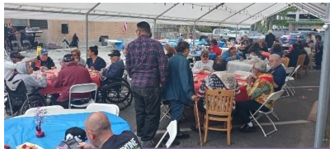
Post 139 Alhambra Memorial Day program Elegant 18 th District