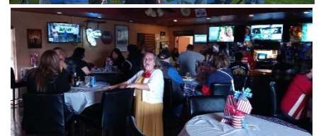
Post 790 West Covina Memorial Day program Elegant 18 th District