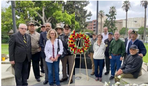
Post 13 Memorial Day program Elegant 18 th District