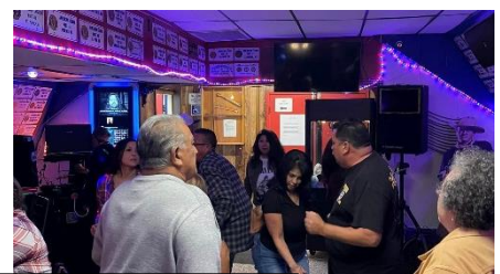
2023-05-05 Auxiliary 180 Cinco De Mayo Party