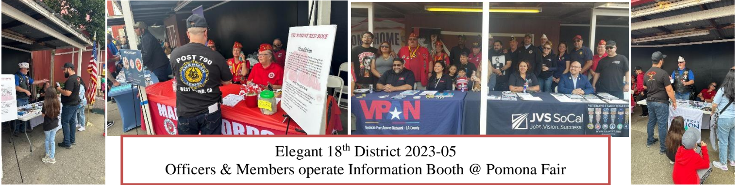
Elegant 18 th District 2023-05 Officers & Members operate Information Booth @ Pomona Fair