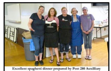
Excellent spaghetti dinner prepared by Post 280 Auxilliary