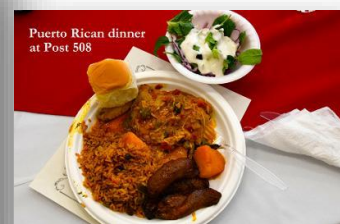
Puerto Rican dinner at Post 508