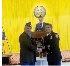
Post-13 First Responders Awards