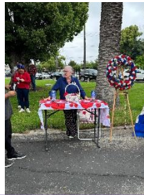
Post 30 Pomona Memorial Day program Elegant 18 th District