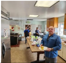
2023-04 SAL-139 Breakfast Fundraiser