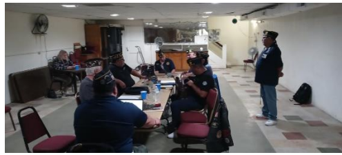
Past Commanders Club Outpost-18 Meeting @ Post 790 West Covina